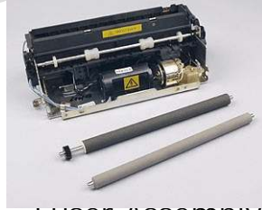
Fuser Assembly, Transfer roller Charge roller